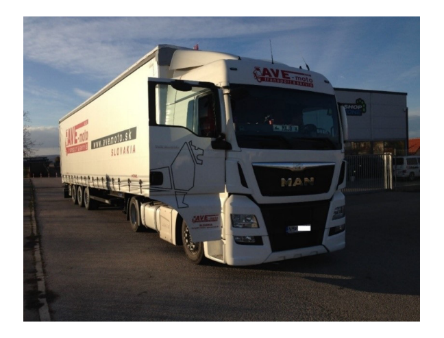
Fig. 2. Examinated vehicle

Atmospheric conditions must be in the following range during the measurement: