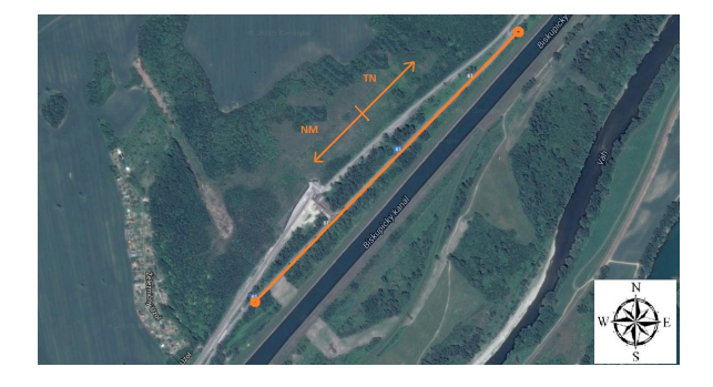
Fig. 3. The test track for the coastdown measurement

curing the same athmospheric conditions during the whole coastdown test.